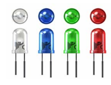
Resin Electrical Encapsulation