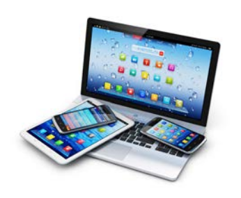
Consumer Product Displays