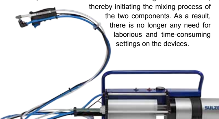
Figure 5: MixCoat™ Flex system

and without being hindered by air tubes and other lines. The lightweight design of MixCoat™ Spray enables precise spraying for a prolonged period minimizing operator fatigue. The system can also be used with just one hand thanks to the dual-stage trigger. If this trigger is pressed only halfway, it activates the compressed air that is required for spraying. When pushed all the way, the compressed air required to dispense the materials from the cartridge is also started,