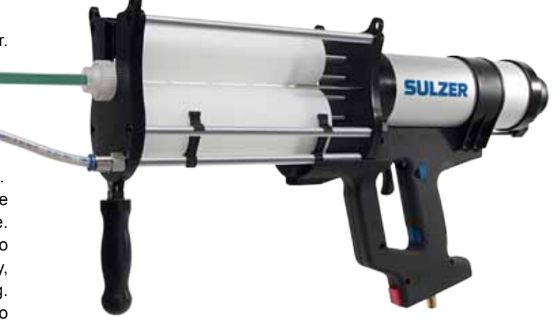
Figure 4: MixCoat™ Spray system

MixCoat™ Flex is is a universal device for coating applications, offering different application methods. In addition to spraying, which is not permitted in every situation under Occupational Health and Safety regulations (OSHA), it can also be used with an attached brush or roller. The robust device is attached to the wall or placed on the ground