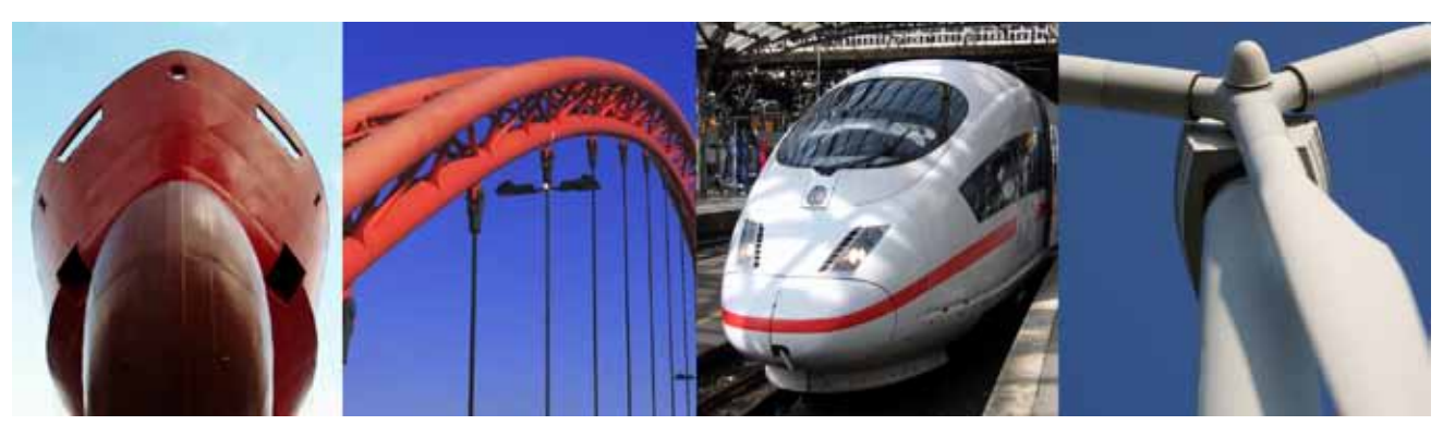
Figure 1: "Applications for 2-K coatings: shipbuilding, steel constructions, trains & railways and wind power plants.

Manual mixing and application presents numerous disadvantages and risks. Both the mixing and the application are very time-consuming, especially when working on large areas. With manual applications, coating materials must be manually mixed in the proper ratio, allowed to dwell (or "sweat-in") for a given period of time, and then the mixed coating must be applied before the open time ("pot life") of the product expires. Moreover, there can be considerable material loss through residues in opened packaging and also through uneven application with the brush.